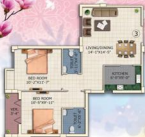
BLOCK-B/A | FLAT-3