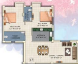
BLOCK-ID | FLAT-17 TYPICAL 1ST TO 5TH SBUA: 1039 SQFT BHK 2