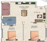
BLOCK-ID | FLAT-15 TYPICAL 1ST TO 5TH SBUA: 721 SQFT BHK 2